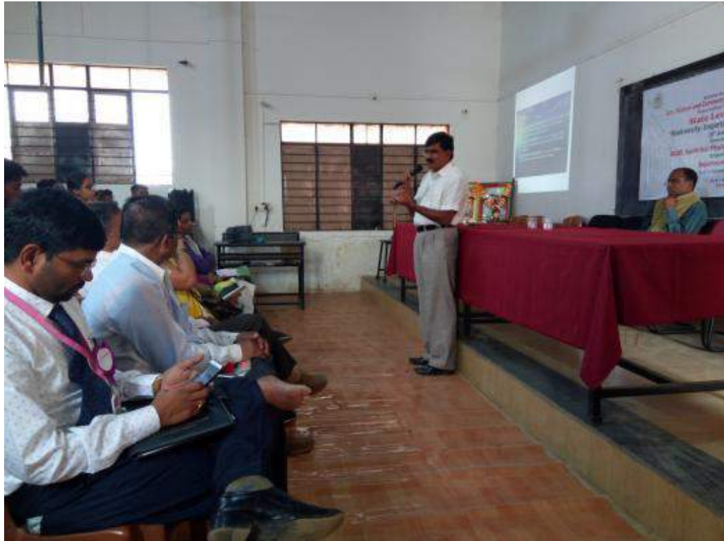
Seminar on Biodiversity: Importance and Conservation on 10-01-2018